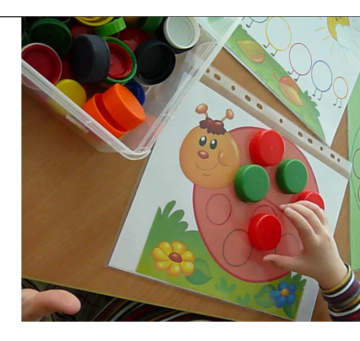
"Find the suitable cover" photo 2