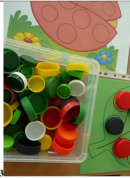
"Find the suitable cover" photo 3