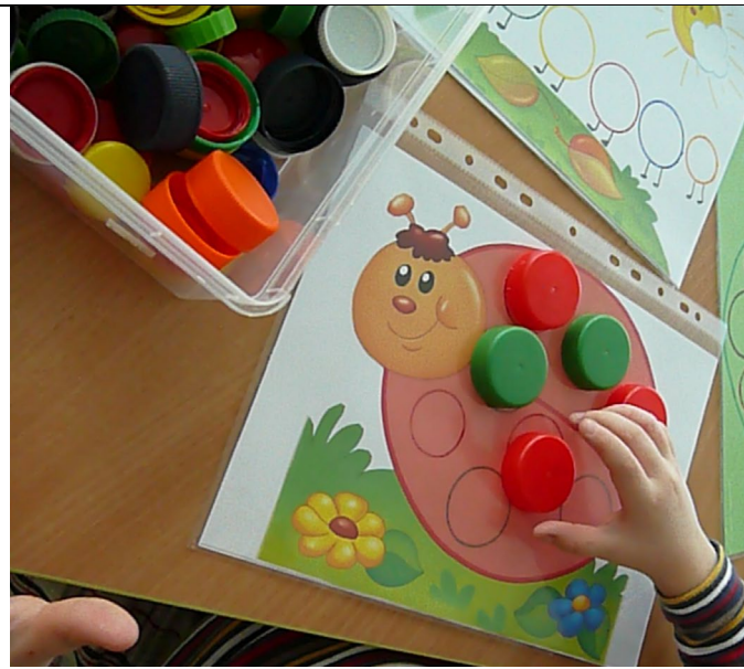
„Find the suitable cover“ photo 2