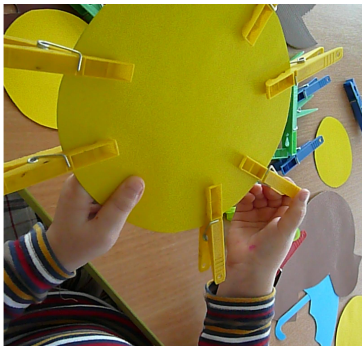
„Exercise a hand“ photo 3