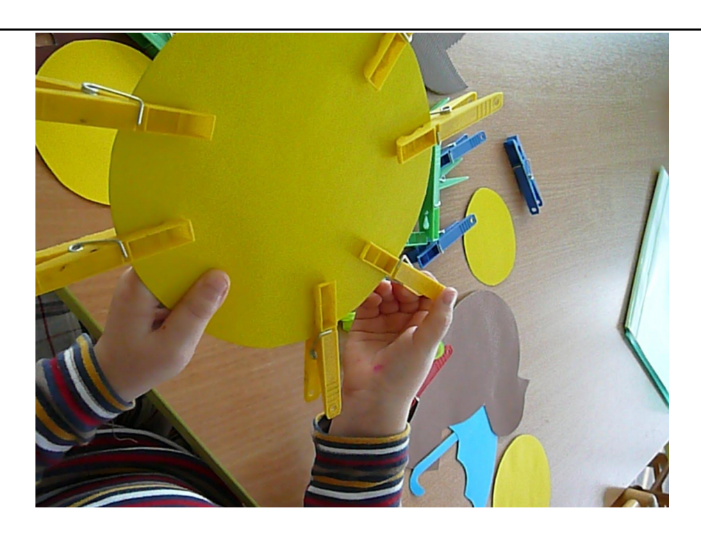
"Exercise a hand" photo 3