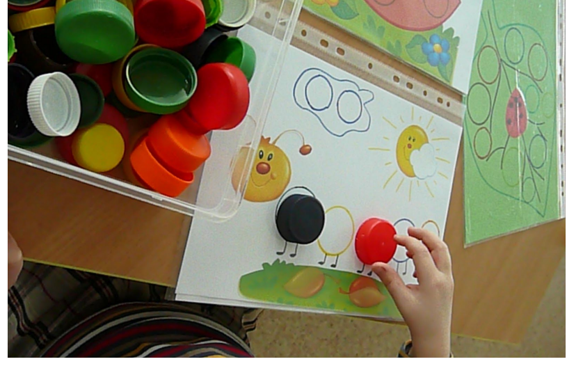
"Find the suitable cover" photo 3