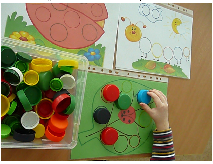
Visual – didactic means "Exercise a hand".

Developing small motoric with the help of visual means.